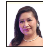
Soci Ame Patagani-Viking Community Service